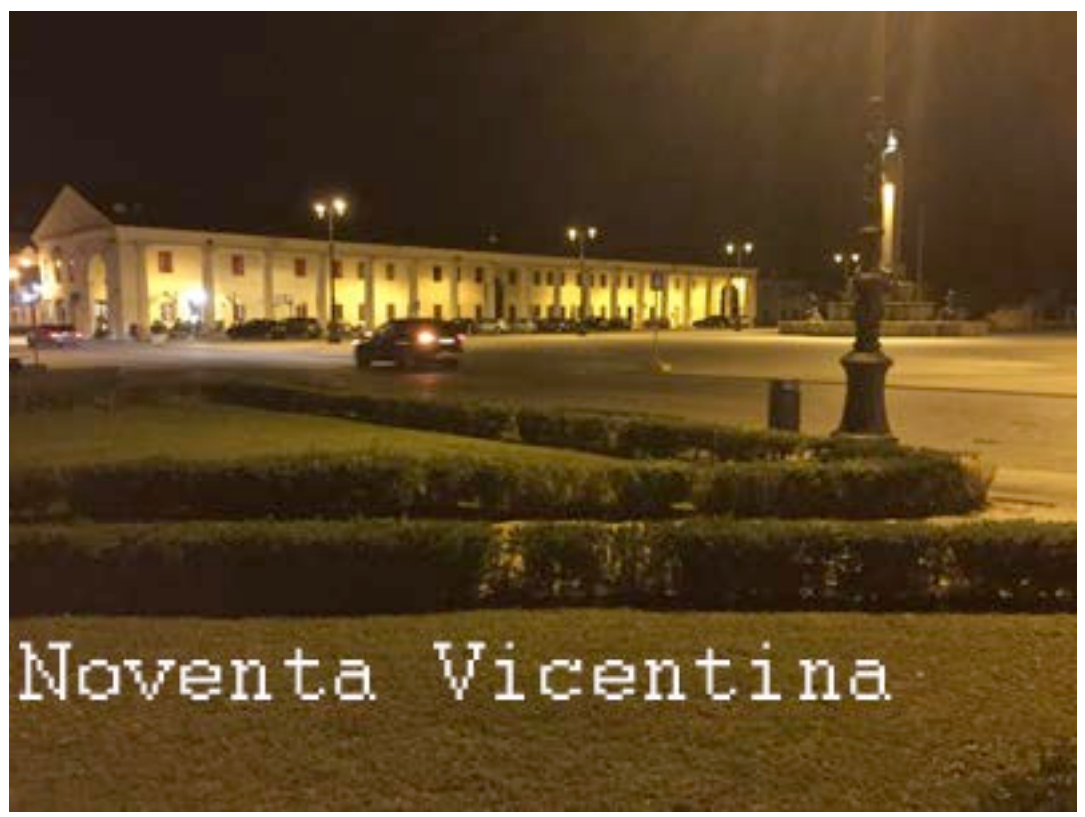
Stables of Villa Barbarigo