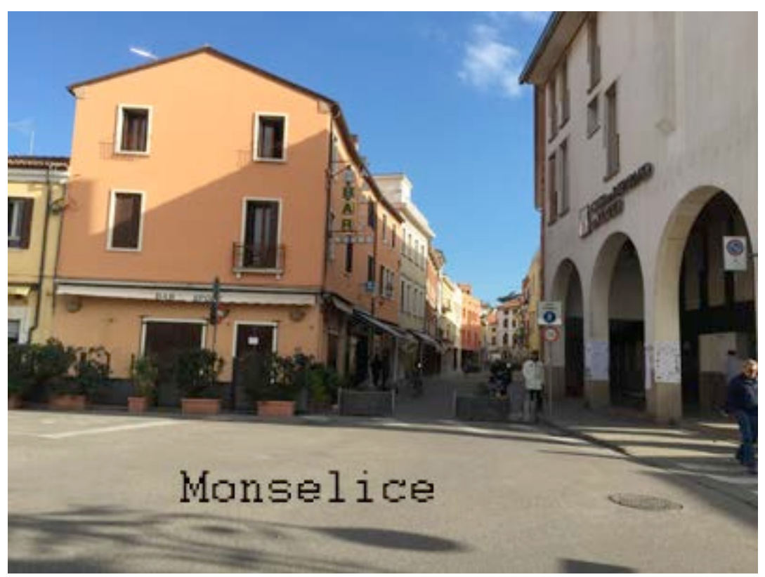
Piazza del Duomo

From Monselice take the road 16 to Montagnana, about 20 km south, direction to Mantua .