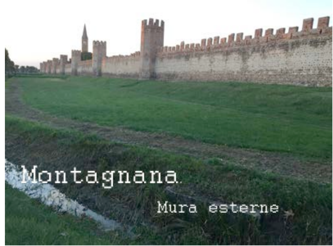
The wall outside