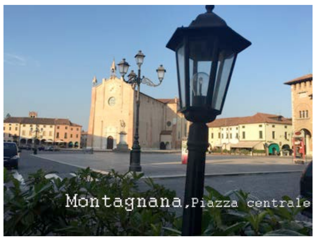
Piazza centrale with Duomo

After Montagnana, visit Pojana, a few km from Montagnana.