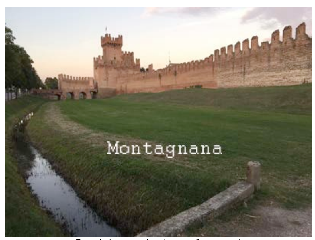
Drawbridge and entrance from west

See the walls also from inside the town. Even inside, the walls are intact.