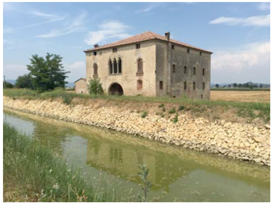
An old manor on the countryside

To arrive, flight to Venice, car towards Bologna, exit Monselice.