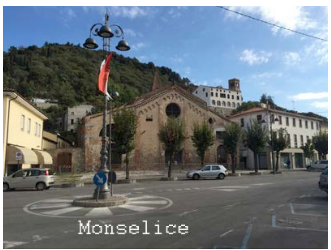
Monselice with the "mont" on the background.

The name Monselice comes from "mountain" and "selice". Selice is the type of stone, that was carved out.